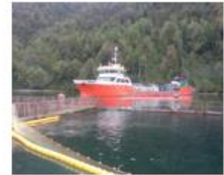
Harvest on Cage

Los Fiordos uses this section to give further details about the harvest, and additionally provides a picture of the fish being processed in our plant. Always focused on the highest quality standards associated to our processes, our company strives towards improvement every day, with the aim of producing the best fish, in order to manufacture the best products for the market. This is one of the reasons why we are today recognized as one of the main companies in our country.