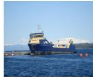
Harvest on Cage