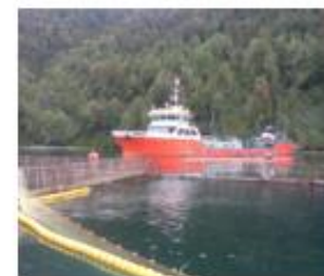
Harvest on Cage

Los Fiordos uses this section to give further details about the harvest, and additionally provides a picture of the fish being processed in our plant. Always focused on the highest quality standards associated to our processes, our company strives towards improvement every day, with the aim of producing the best fish, in order to manufacture the best products for the market. This is one of the reasons why we are today recognized as one of the main companies in our country.