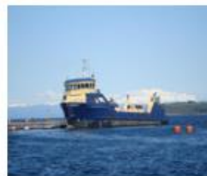
Harvest on Cage